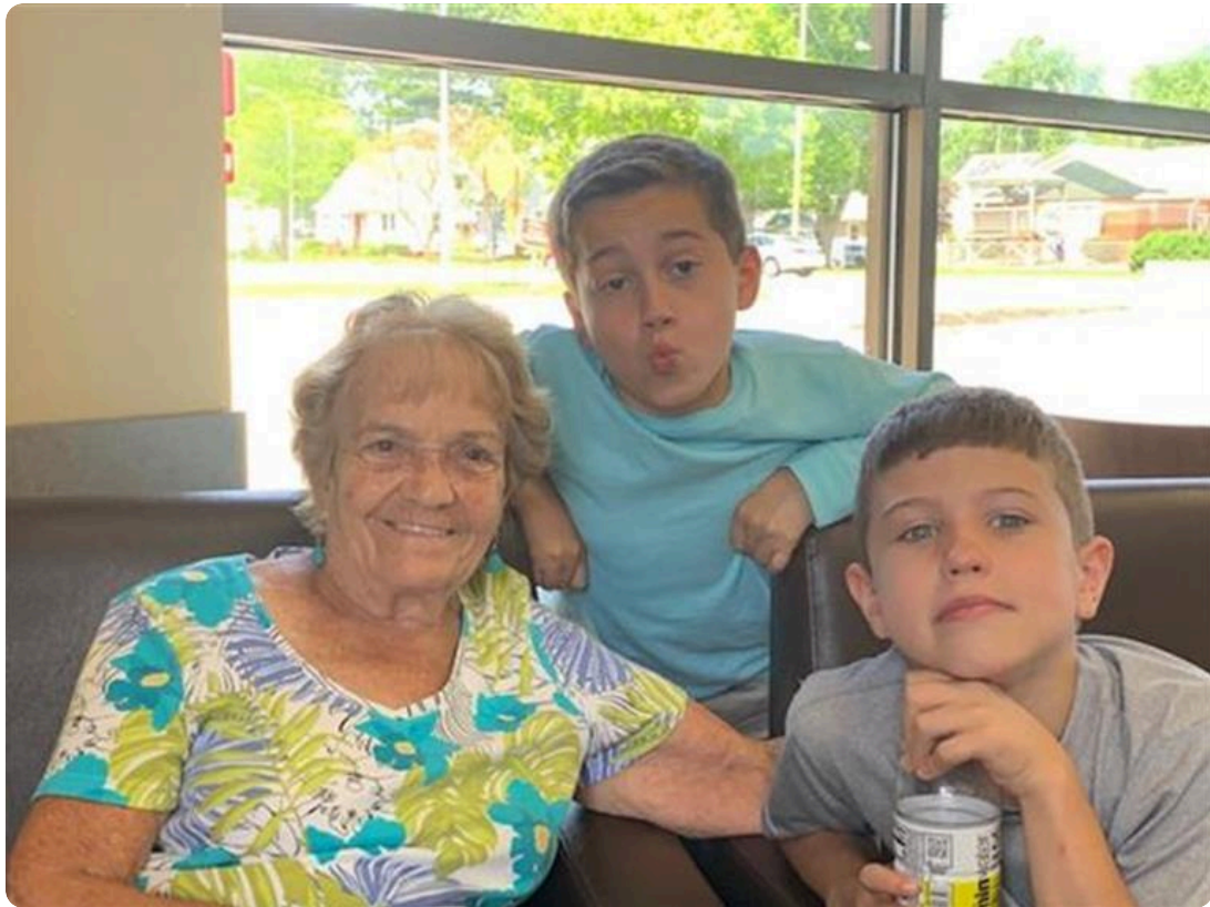
We love you Aunt Nita!